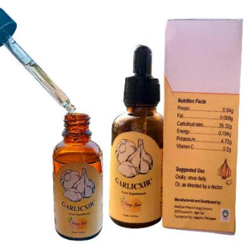
Fig. 2. Final product developed

The formulated garlic bulb elixir is a clear sweetened hydro-alcoholic liquid with an orange flavor and strong alcoholic aroma with a faint of orange-like odor. On the other hand, the garlic bulb syrup is a slightly turbid viscous liquid with a lemon flavor and lemon-like odor.